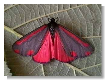
Cinnabar moth Tyria jacobaeae

I think the trip was a success because of the good company, the walk